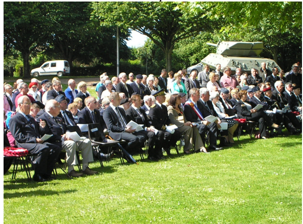
The congregation at Bayeux