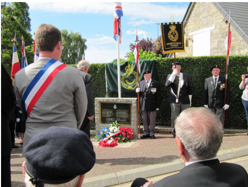
Ceremony at SRY Memorial at St Pierre