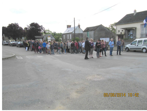
Berjou - waiting for the start