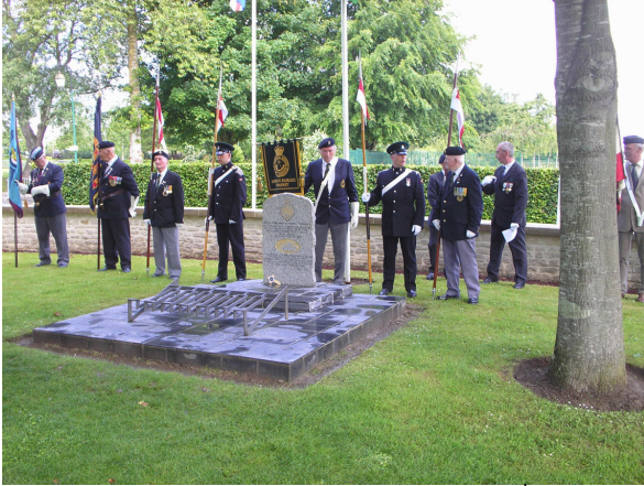
The SRY memorial at Bayeux on 7 th June