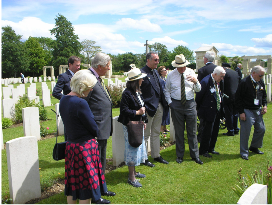
At Tilly Cemetery