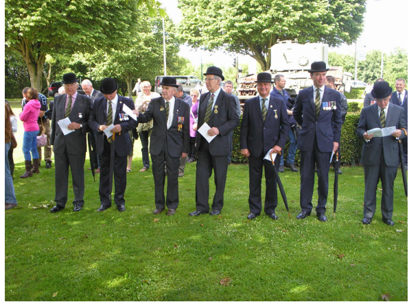
The officers on parade