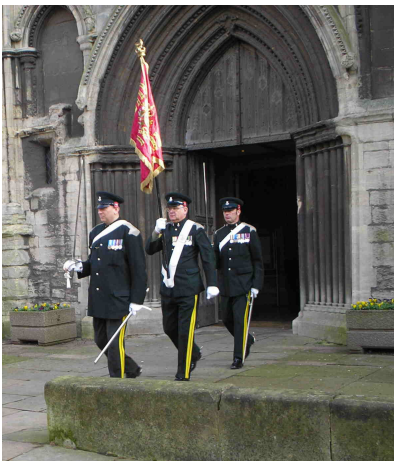
The Guidon Party marching on