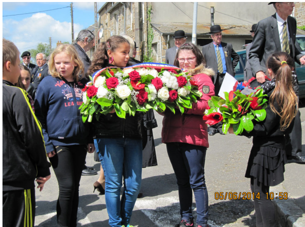
The children with their wreaths