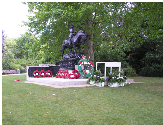
The Cavalry Memorial, Hyde Park

This year the Cavalry Memorial Parade will be held on Sunday 10 th May in Hyde Park and I hope that the Regiment will be well represented. Detailed arrangements will be co-ordinated through the Midlands Branch so, if you would like to attend, please contact the Branch Secretary. I assume that the RY will, as usual, be organising a lunch after the parade. If you would like to attend the RY lunch, please let me know as soon as possible.