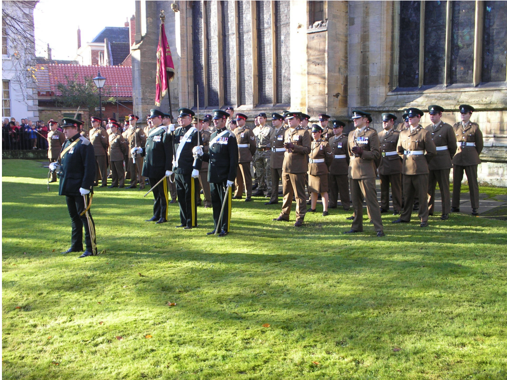
The Sqn on parade at Newark