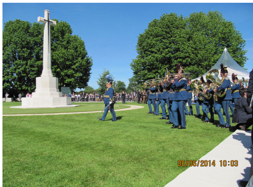
The RY Band Marching on