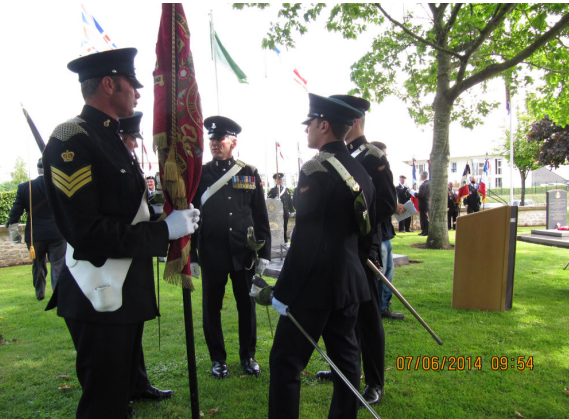
Before the service