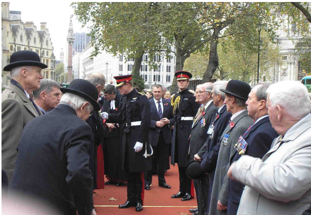
Prince Harry inspecting the plots