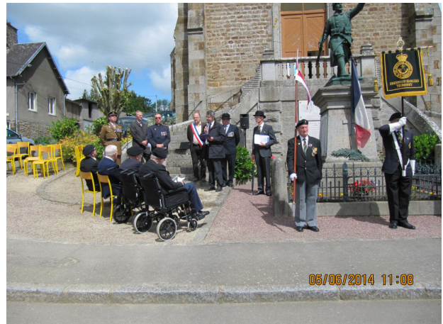
The Ceremony at the memorial