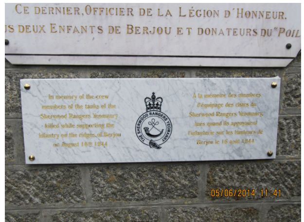
The new SRY Memorial at Berjou Church