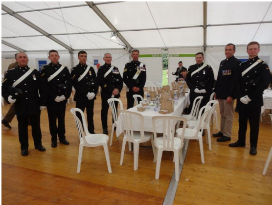
The Guidon Party with the Padre in the lunch tent