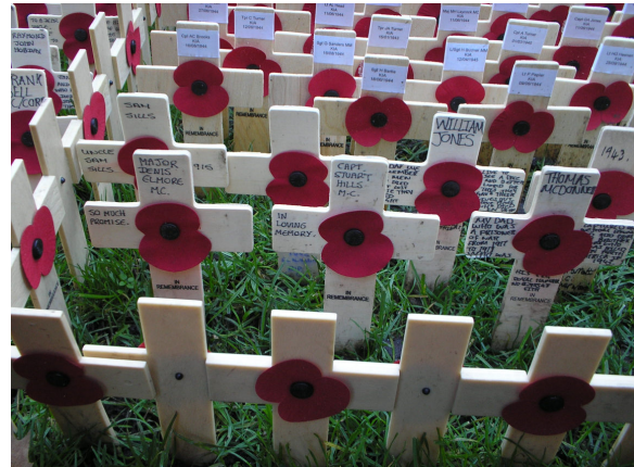
SRY Remembrance crosses

This year the ceremony will be held on Thursday 5 th November. Security is heightened these days and, if you would like to come, you will need a ticket. However, I hope that anyone who would like to attend will not be deterred. Please give me at least eight weeks notice so that I can make the necessary arrangements on your behalf.