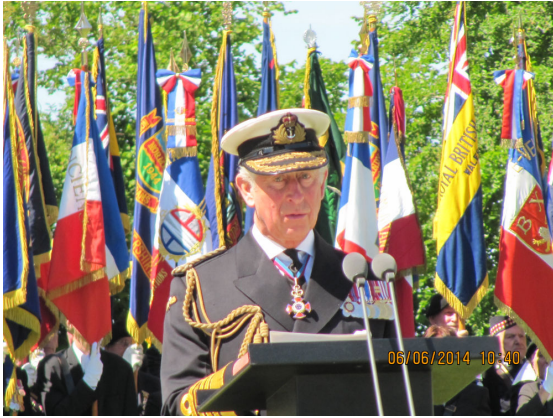
Prince Charles reading the Lesson