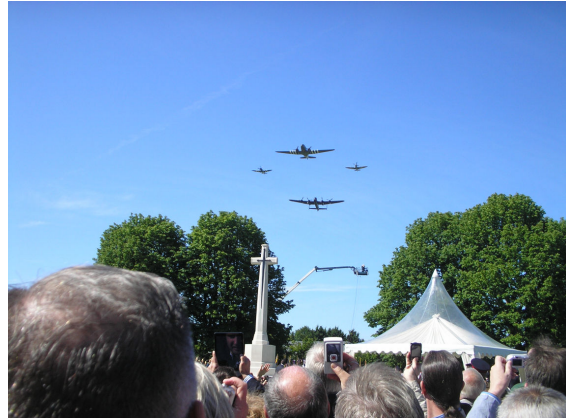
Historic aircraft fly past