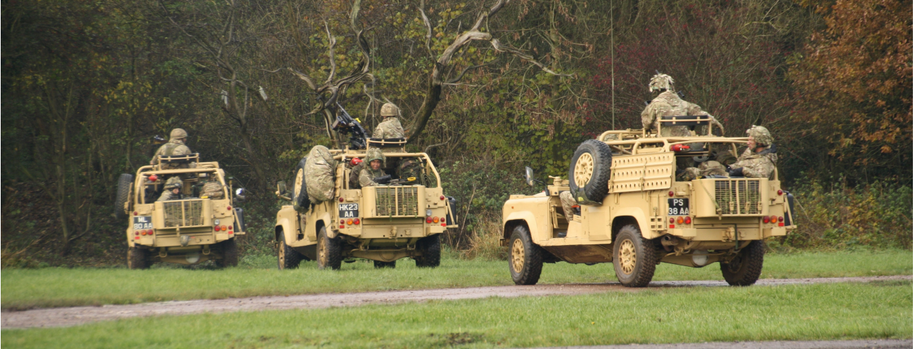
The Sqn on exercise